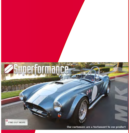
MK II 289 Cobra