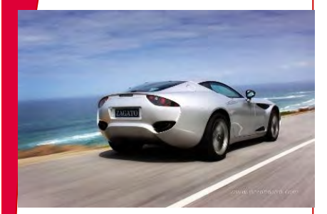
Superformance Perana Z— One