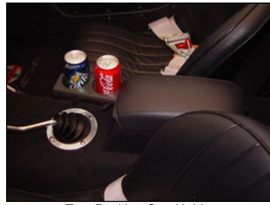
Two Position Cup Holder

The left tab raises the lid. The right tab slides out to provide a two position cup holder.