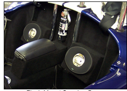
Flush Mount Speaker Boxes

The Flush Mount Speaker Boxes are designed specifically for the Mk III to work effectively behind the seats with no cutting of the bulkhead required. They are covered with carpet matching the interior carpet giving them a factory installed appearance. The speaker boxes mount to the rear bulkhead behind the seats with two small screws per box (recommended) or Velcro.