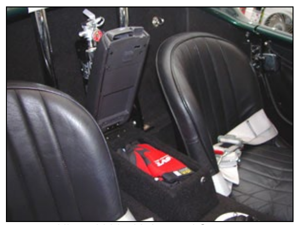
Hinged Lid with Internal Storage

angles with that of the Mk III. Original style carpet material is utilized on front and side surfaces to enhance the OEM appearance of the entire assembly.