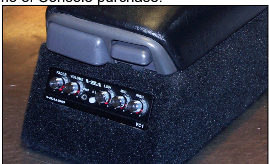
Audio System Controls

The Console mounted pre-amp can be added at the time of Console purchase.