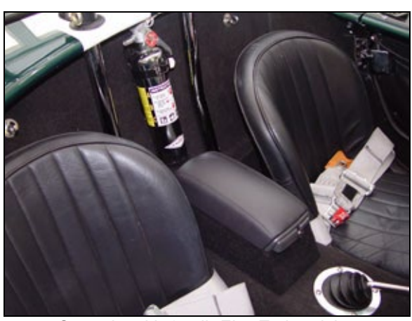
Console with 2.5 lb Fire Extinguisher

The console is 16" long, 6" wide and 6.5" high with approximately 250 cubic inches of storage.