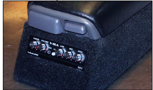
Audio System Controls

The Console mounted pre-amp can be added at the time of Console purchase.