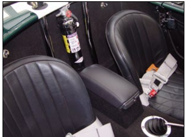
Console with 2.5 lb Fire Extinguisher

The console is 16" long, 6" wide and 6.5" high with approximately 250 cubic inches of storage.