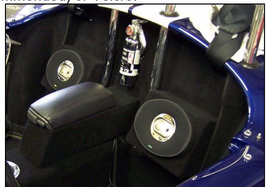
Flush Mount Speaker Boxes

The Flush Mount Speaker Boxes are designed specifically for the Mk III to work effectively behind the seats with no cutting of the bulkhead required. They are covered with carpet matching the interior carpet giving them a factory installed appearance. The speaker boxes mount to the rear bulkhead behind the seats with two small screws per box (recommended) or Velcro.