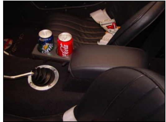
Two Position Cup Holder

The left tab raises the lid. The right tab slides out to provide a two position cup holder.