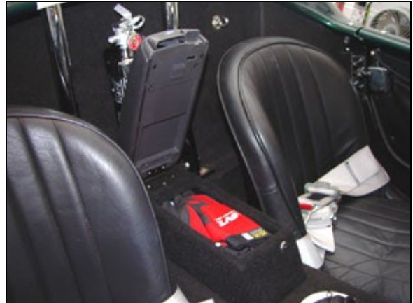
Hinged Lid with Internal Storage

angles with that of the Mk III. Original style carpet material is utilized on front and side surfaces to enhance the OEM appearance of the entire assembly.